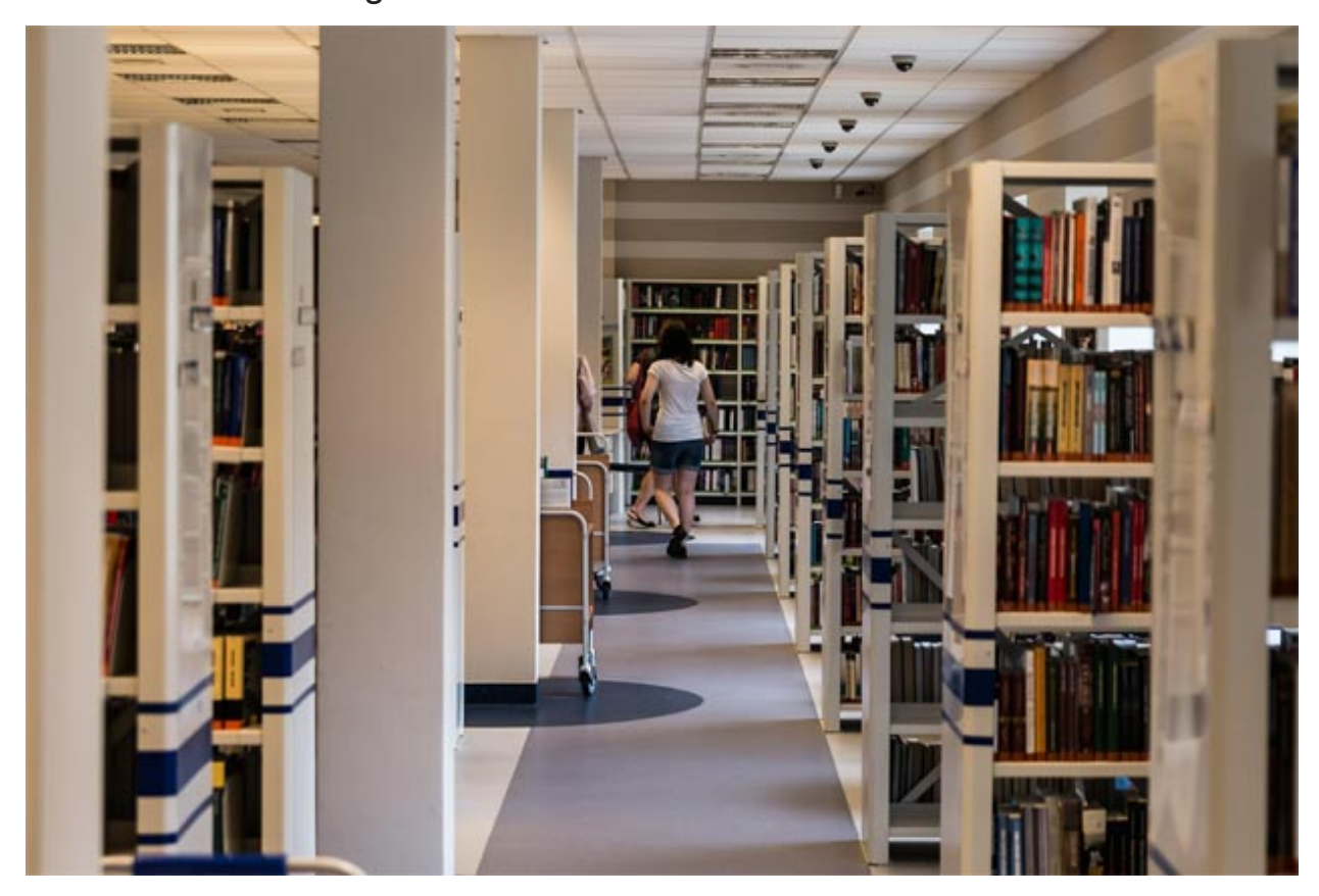
Spend Each Day Learning Something New

What you can actually do, is when these doubts enter your mind, and you start thinking about all the ways that this could possibly go wrong, take a step back, and evaluate where the thoughts are coming from. Remember, just because your subconscious believes something to be true doesn't mean it is. So rather than trying to push away these negative thoughts or avoid them, accept them and then work to eradicate them by finding out which belief is driving them.